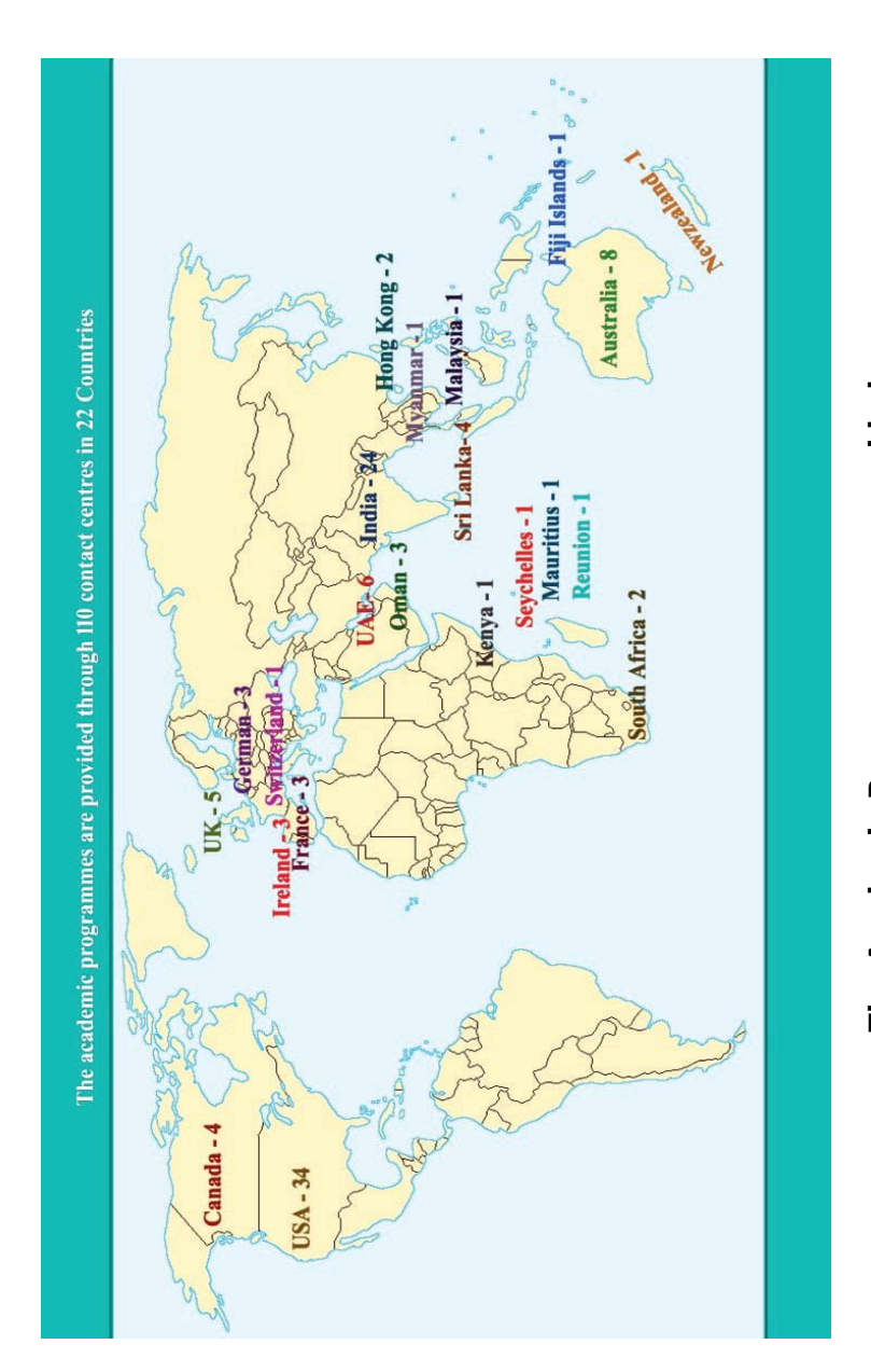
The Academic Programmes are provided through 110 Contact Centres in 22 countries