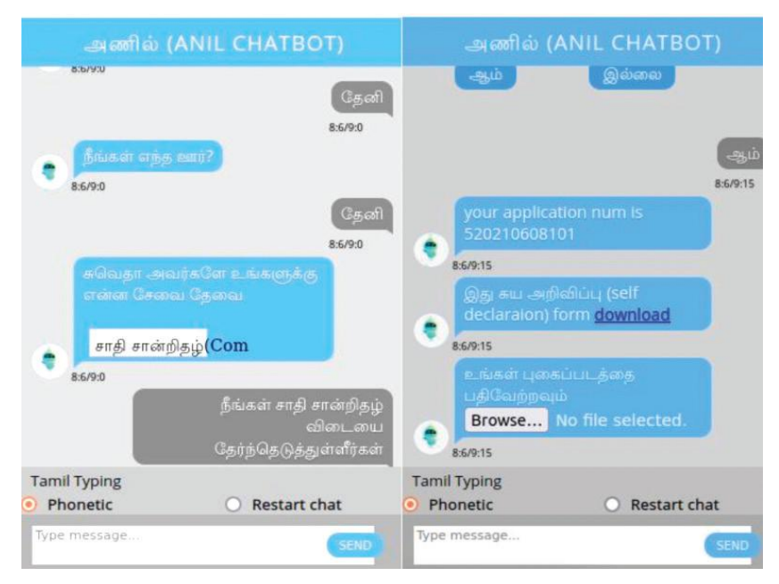
Applying for a Community Certificate using Chatbot