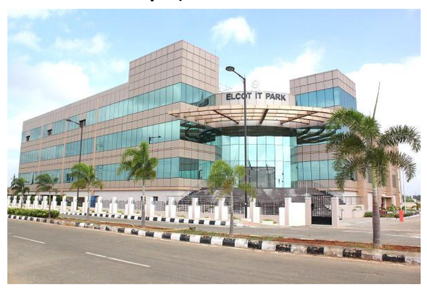
ELCOSEZ – Ilandhaikulam, Madurai